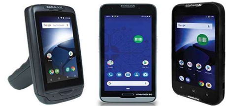
ProfitTrax Goes Mobile With All New Scan-it® Solution

Scan-it easily integrates with the ProfitTrax System for Fresh Item Sales Forecasting & Production Planning, specialized Merchant Analytics, and Variety Optimization for one Connected Store System.